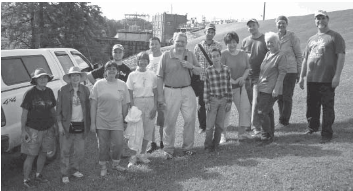
Some happy FPS members after collecting hundreds of sharks teeth (and a few crabs!) from the middle Eocene deposits exposed along the Conecuh River in southern Alabama.

Saturday morning started quite early as we had to meet back in the motel lobby to get some breakfast