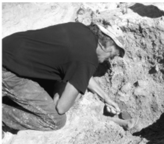
Aphelops humerus in green clay.