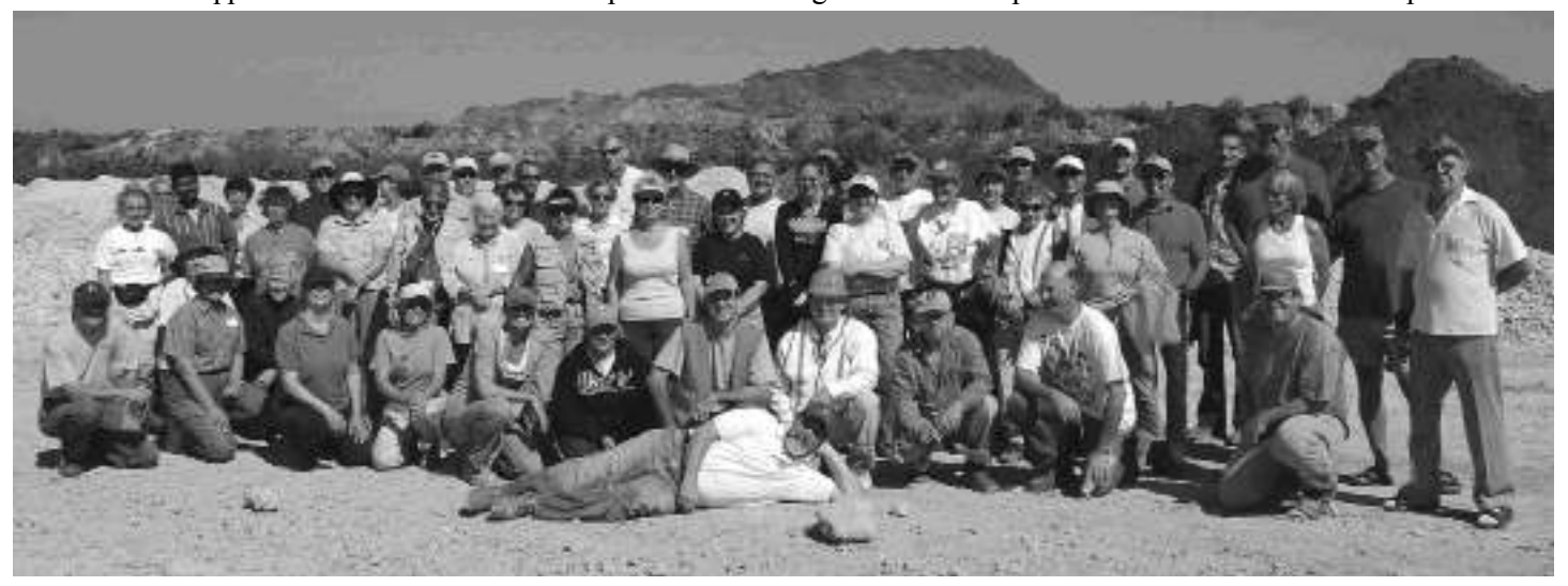
Attendees of the FPS field trip to the SMR Aggregates Quarry, Bradenton. Hundreds of Pliocene sea shells, shark teeth, and marine mammal bones were carted away by this enthusiastic group.

We retired for the afternoon to rest and clean up. We met for dinner at a nearby restaurant where we dined, talked, enjoyed good lectures and purchased auction items. Our first speaker of the